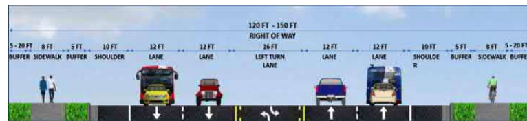
Proposed Roadway Typical Section