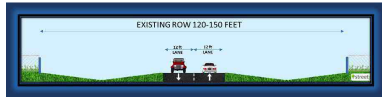
Existing Roadway Typical Section

Estimated Construction Start Date: Fiscal Year 2025