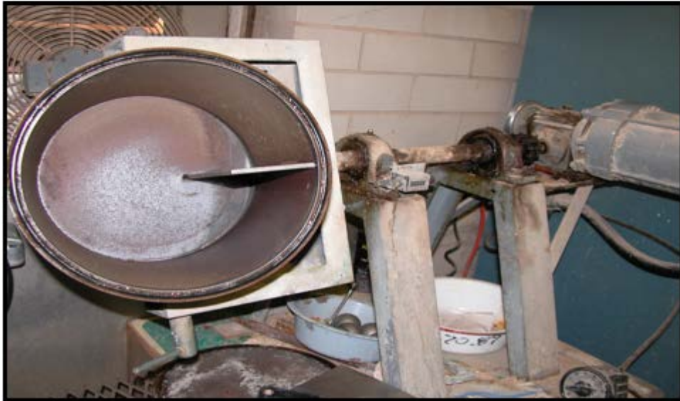
Figure A4: Tex-116-E, Wet Ball Mill Testing Equipment