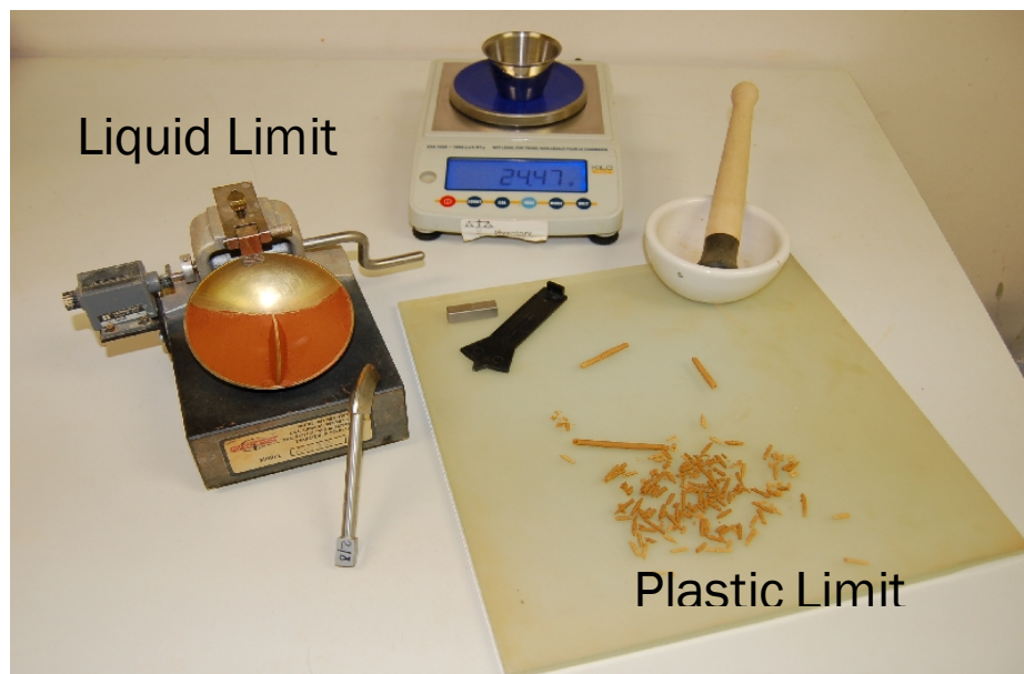
Figure A1: Tex-104, 105, and 106-E, Liquid and Plastic Limit Testing Equipment

The PI is determined from measuring the liquid and plastic limits. The liquid limit is the moisture content at which a soil changes from a plastic to liquid state of consistency. The plastic limit is the lowest moisture content at which the soil can be rolled into a thread of 1/8-in. diameter without breaking into pieces. The PI is calculated by subtracting the plastic limit from the liquid limit. Figure A1 illustrates the testing equipment used to measure the liquid and plastic limits.