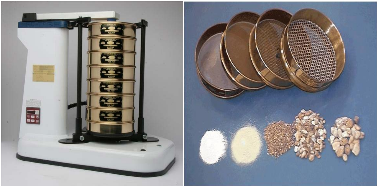
Figure A2: Tex-110-E, Mechanical Sieve Shaker and Wire Mesh Sieves

Tex-110-E measures the gradation of the base material using a mechanical shaker and wire sieves, as shown in Figure A2. Sieving consists of passing a known quantity of dry aggregate through a set of sieves. The sieves have rectangular openings and are shaken either in a vertical or vertical and horizontal motion that causes the aggregate to move over the surface of the sieve.