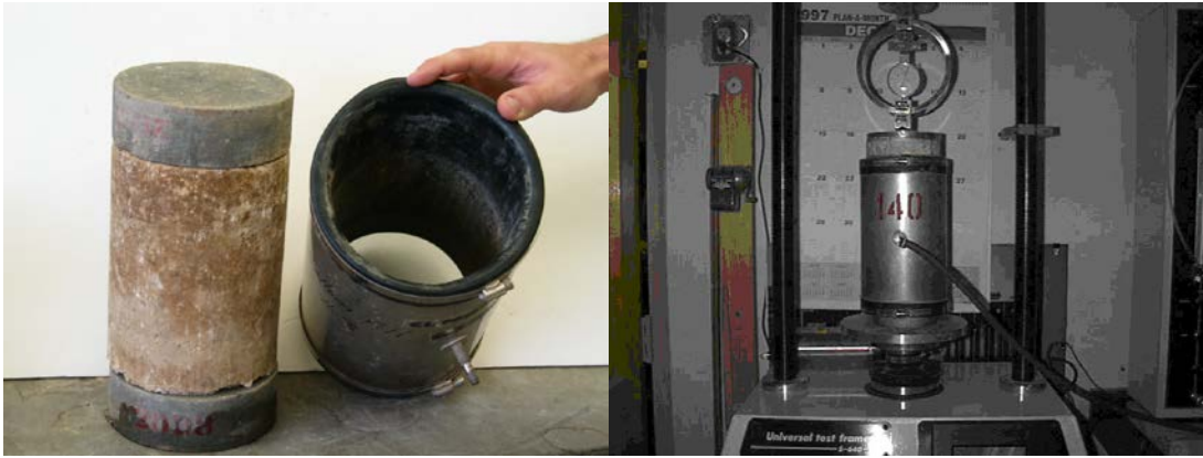
Figure A6: Tex-117-E, Compressive Strength Testing Equipment