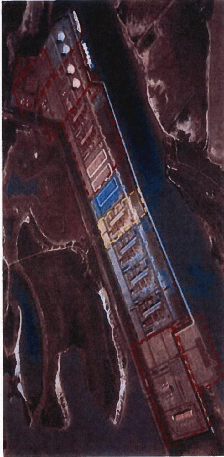
Exhibit 4 Site Plan